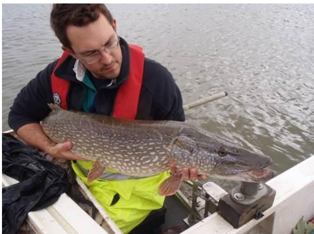
Monitoring Thames Pike on a Fish Population Survey

Kindly donated by Hop Kettle Brewing Company at the Red Lion Inn, Cricklade